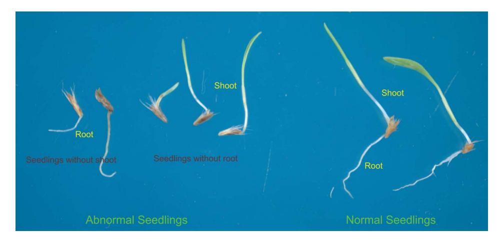
FIGURE 1 Shows normal seedlings (right) and abnormal seedlings (left) of the Palmarosa crop.

Data on normal seedlings were used for analyses. Germination percentage, seedling vigor index I, and seedling vigor index II were calculated as shown below (ISTA 2010; Kumar, Verma, & Singh 2011; Kumar 2012):